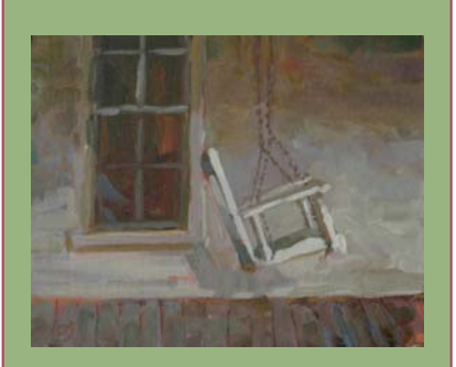
Oil painting by Christopher Greco entitled "Swinging, Still – Gardner Homestead"

Learn more about Volksmarching at <a href="https://www.ava.org"><u>www.ava.org</u></a>